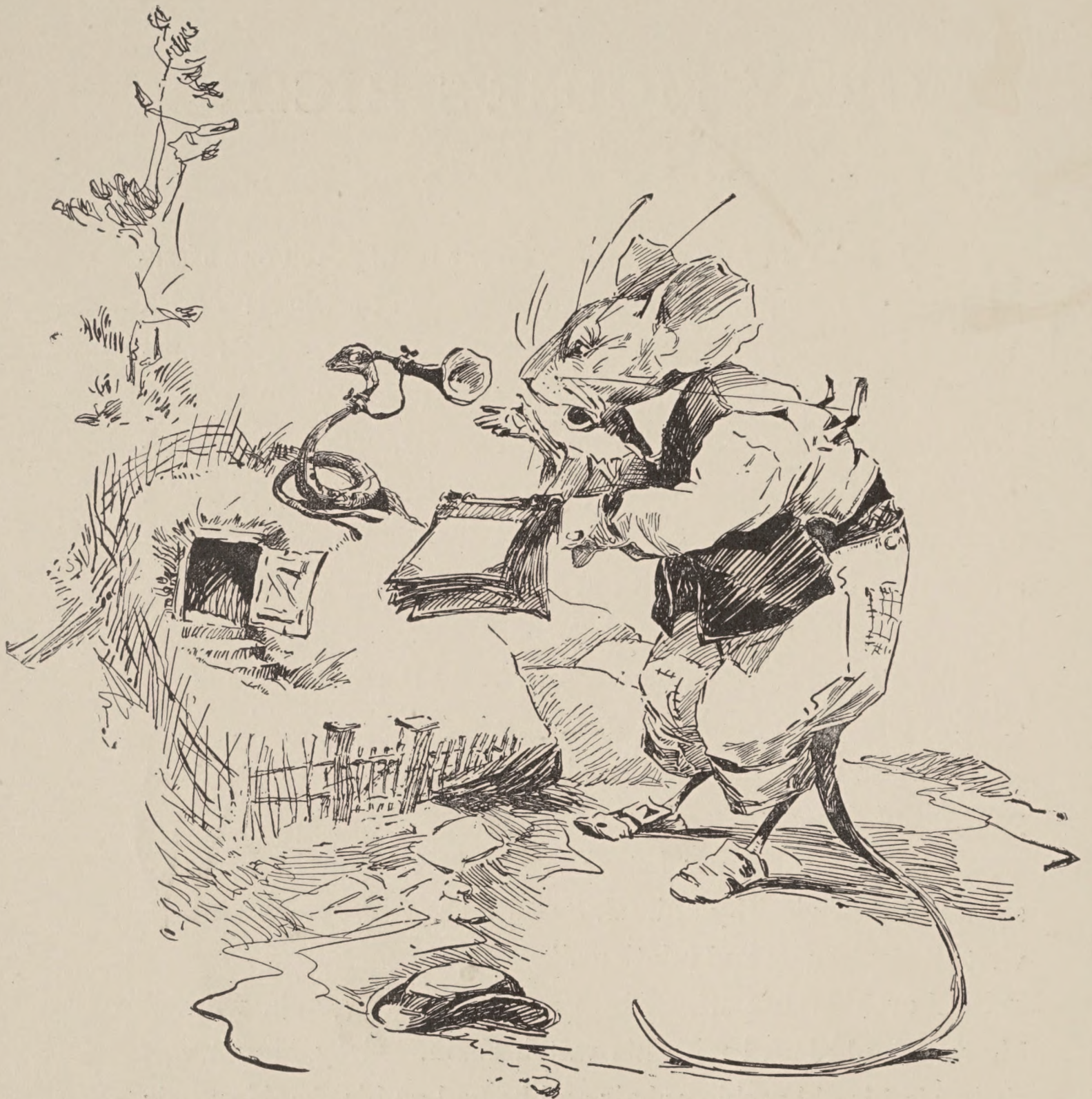
ADDER ASKS WHAT WITCH CHURCH MOUSE MEANS.